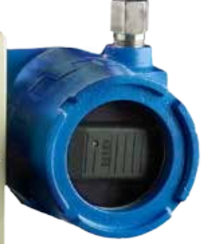
The microLoad.net features a stand-alone database which interfaces with the Smith Meter Card Reader for secure driver access.