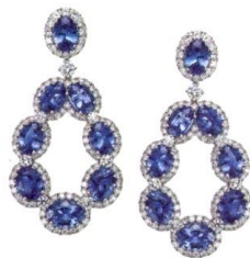
●●● White gold earrings set with oval sapphires and round diamonds, by Picchiotti