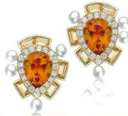
●●● Wisteria yellow gold studs set with white diamonds, citrine, spessartite and pearls, by Sarah Ho