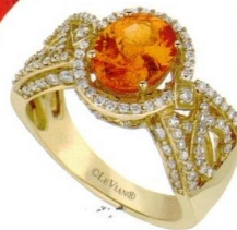
●●● Mandarin Garnet gold ring, by Le Vian