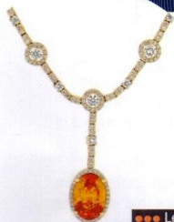
●●● Le Vian's Mandarin garnet necklace

While the various permutations, combinations seem exciting, let's also remain cognisant of what will look best on our skin tone. Colours of Paraiba tourmaline, certain shades of Colombian emeralds, aquamarines, and brighter pink sapphires will only suit ladies who have a cooler and fairer skin tone. Deeper hued gems work better for ladies that have a warm undertone. Another important point, specific gems such as rubies, spinel, red garnet, and red tourmaline look best in incandescent light. The yellow light will always make red gems appear more attractive.