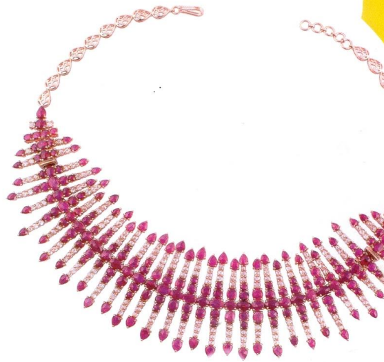
●●● Gem Plaza gold necklace with Gemfields Mozambican rubies and diamonds.