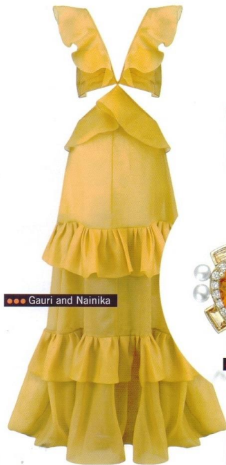
●●● Gauri and Nainika

With every hue you encounter, whether in gems or fashion, there will be complementary and contrasting colours. For example, the Mandarin Garnet has recently become very popular, with brands like Louis Vuitton using it in their high-jewellery collection, but that deep orange colour can be challenging to pair. While yellow and red would naturally be a good fit, dare to wear an orange gem with a blue outfit for a spectacular effect.