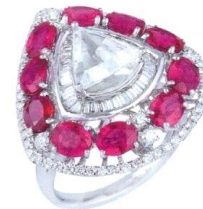
●●● 18-karat white gold ring set with a triangular rose-cut diamond with a surround of baguettes, further lined with oval rubies and round diamonds, by Asian Star

The #1 trend in jewellery today is colour. Step outside the box, dig deep into your jewellery drawers, or when all else fails, go on a shopping spree to bring colour back in your life. Each gemstone is exceptional, no two rubies will have the same shade of red, just like every woman is distinctive. What may be a perfect colour of an emerald for one person, may not be the preference of another. Each is unique, created under rare circumstances, but when polished and cut through its journey of life, grows into a beautiful gem that brings radiance, light and romance to our world.