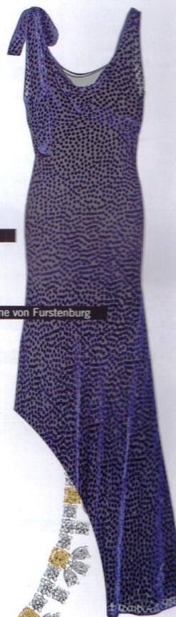
Diane von Furstenburg