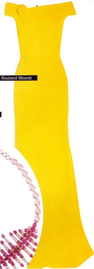
●●● Rouland Mouret