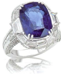
●●● Platinum ring set with a 10.25-carat cushion-cut Sri Lanka vivid royal blue sapphire and diamonds, by Picchiotti

Now that we have understood the impact of light, skin tone and colour combinations, let's talk location. A beautiful, warm coloured ruby purchased in Bangkok, which is closer to the equator, will become darker when it travels north to a city like London, New York or even foggy Delhi in winter. The solution is being aware of where you are likely to wear it the most and accordingly select a brighter or deeper colour. Important to remember when packing for those destination weddings!