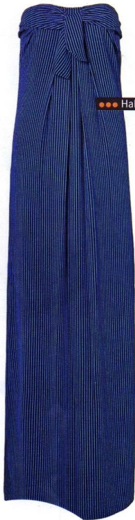
●●● Halston Heritage