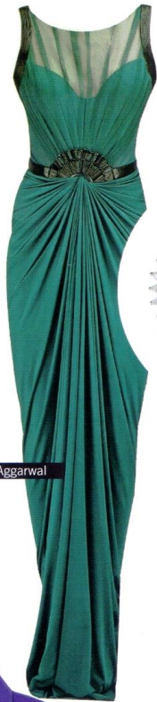
●●● Amit Aggarwal