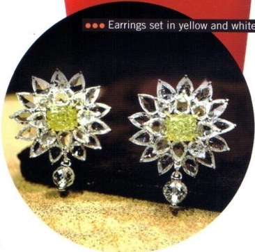
Earrings set in yellow and white diamonds, by Savaab.