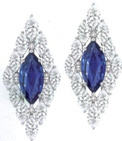
●●● Sapphire Marquis and diamond earrings, by Sutra