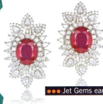
●●● Jet Gems earrings set with Gemfields Mozambican rubies.