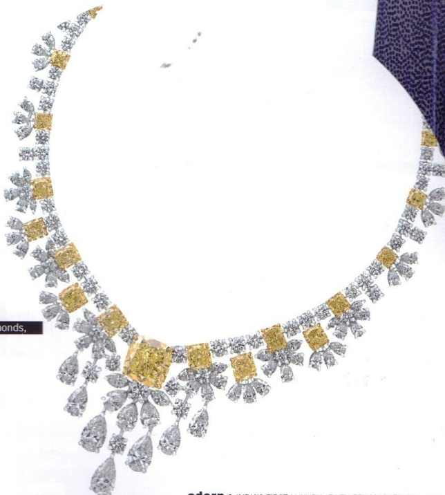
White gold necklace fashioned with radiant-cut yellow diamonds, white round and pear diamonds, by Graff

Outfits curated by Dipika Israni Panjabi of DI Public Relations.