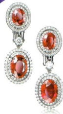
●●● Adler ruby earrings

Matching a coloured gem with the diverse colour palette of Indian fashion may seem quite daunting, but worry not. The possibilities of teaming gems with ensembles are endless. The ruby necklace or earring may look complementary when worn with a purple or a yellow outfit, and bold when worn with a green one! Moreover, the impact of light on a coloured gemstone is significant to consider.