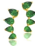
●●● Gold earrings set with pear-cut Gemfields Zambian emeralds, by House of Meraki