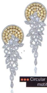
Circular yellow diamond posts suspend a foliar motif in white diamonds, by Gehna