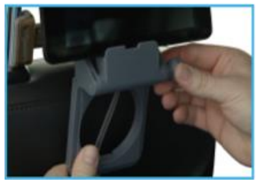
Step 4: Place a beverage in the cup holder or watch a device like it was built into the headrest! Lower beverage support out of the way if not needed.