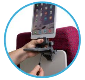
<u>Step 7:</u> POSITION device perch to desired viewing angle, tighten upper knob until movement is no longer possible.

PRO TIP: Adjust the bungee size for your device before mounting to Tray Table for easier access to rear of device.