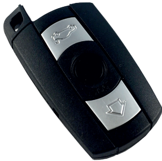
BMW HTspy key