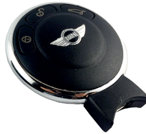
Mini HTspy key

The ADVANCED kit includes HTpro and HTspy keys for BMW and MINI.