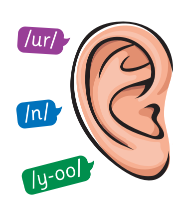
listen to the phonemes