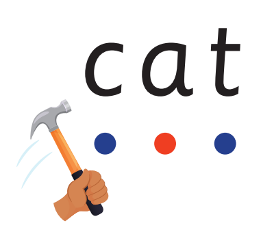
build a word