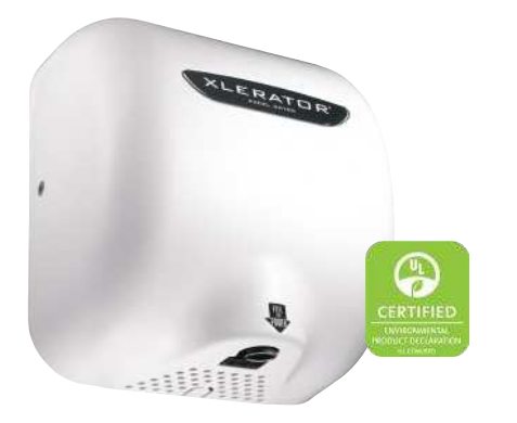
XL-BW White Thermoset Resin (BMC)