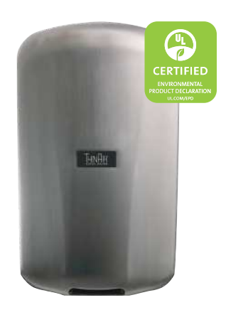
TA-SB Brushed Stainless Steel