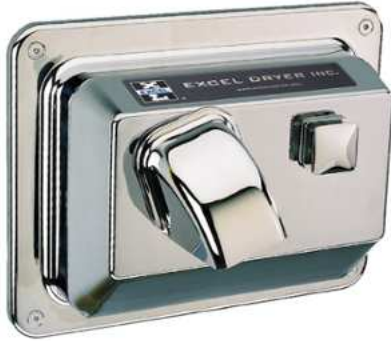
PART # R76-C