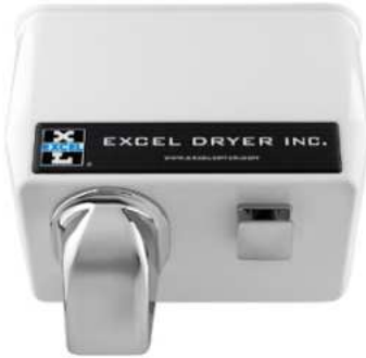
PART # 76-W