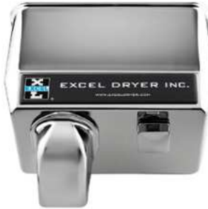
PART # 76-C