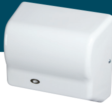
Steel White Epoxy