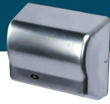
Steel Satin Chrome