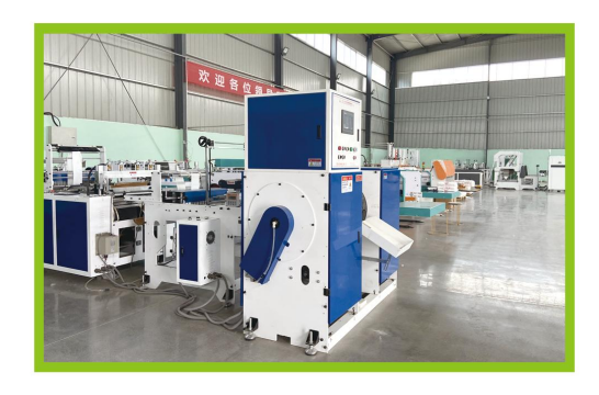
生产车间场景 Production workshop scenario