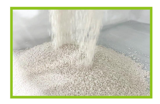
生产车间场景 Production workshop scenario