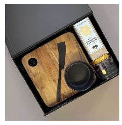
SWEET & SAVOURY

WOODEN BOARD DIP BOWL PAUL & PIPPA BISCUITS CHEESE KNIFE CHOCA MAMA MILK PRETZELS BOX & SHRED