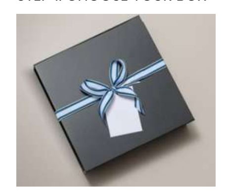
STEP 1: CHOOSE YOUR BOX