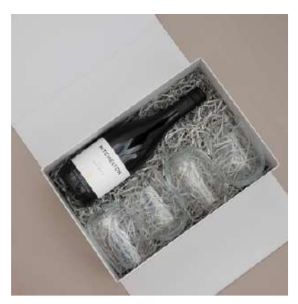
CHEERS TO US

MITCHELTON SHIRAZ STEMLESS WINE GLASSES SET OF 4 BOX & SHRED