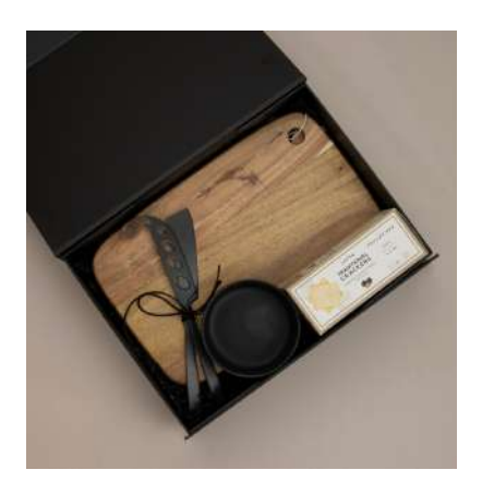
CHEESE & DIP

DIP BOWL CHEESE KNIFE SET OF 2 TIMBER BOARD PAUL & PIPPA BISCUITS BOX & SHRED