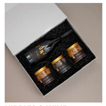
NIBBLES & WINE

ZONZO PINOT NOIR CHOCOMAMA CHOCOLATE PRETZELS CHOCOMAMA COCKTAIL MIX CHOCOMAMA FIREBALL MIX BOX & SHRED