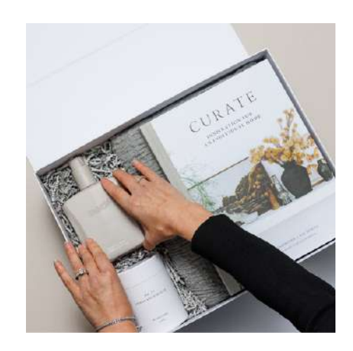
STEP 3: CHOOSE YOUR BRANDING OPTIONS