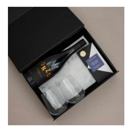
MARBLE & WINE

ZONZO PINOT NOIR MARBLE BOARD KOKO BLACK CHOCOLATE STEMLESS WINE GLASSES SET OF 2 ROX & SHRED