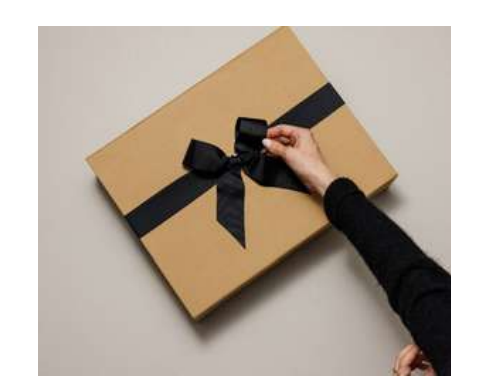
STEP 2: CHOOSE FROM OUR CATALOGUE OR LET US CREATE A CUSTOM GIFT