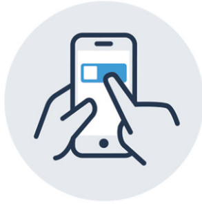
Click the pop-up