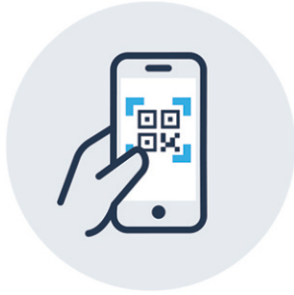
Frame the QR