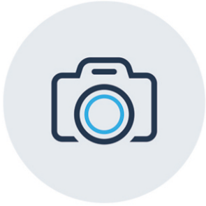
Turn on camera app

If you need to reprint this template, please make sure your printer is set to 100% and it should match the measurements shown here.