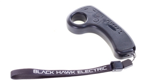
Mtn Series Remote Control