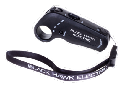
Standard Remote Control