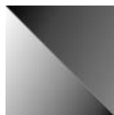
OP71 matt white