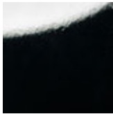
L3 polished black lacquered