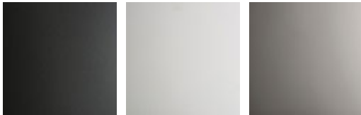
OP69 matt graphite