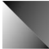
OP71 matt white