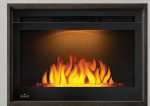
CINEMA™ GLASS 24 INCH FIREPLACE