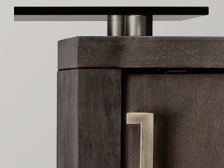
10MM TEMPERED SMOKE GLASS TOP