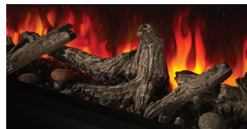
Beach Fire logs and Woodland media kit included for a realistic appearance