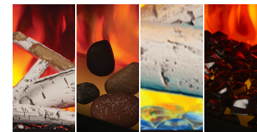
Optional media includes Birch Logs, Mineral Rock, Glass Beads, Black Crystals