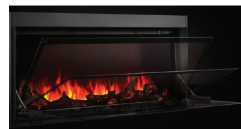
Unique flip-down style glass so you can easily change the media