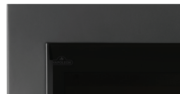
Limitless installations options - enjoy a frameless appearance or install the incl. adjustable finishing trim