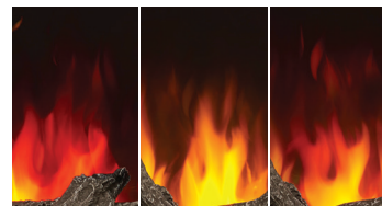
Orange, yellow and combined flame color options featuring spark technology