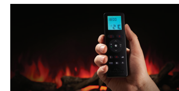
Included premium remote, Napoleon Home mobile app or optional wall mount control