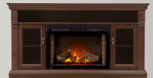
ESSENTIAL SERIES MANTEL PACKAGE