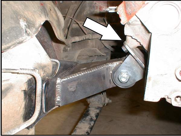
Passenger side looking from the front of the Jeep® toward the back. The arrow indicates where you may need to insert extra block spacers, in some applications.