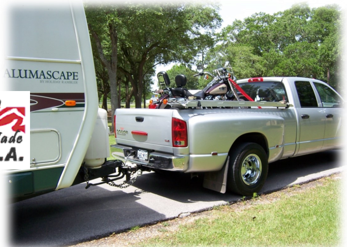
Pickup & Motorcycle w/Travel Trailer