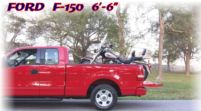
FORD F-150 6'-6"