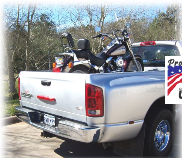
Dodge 3500 8' Bed