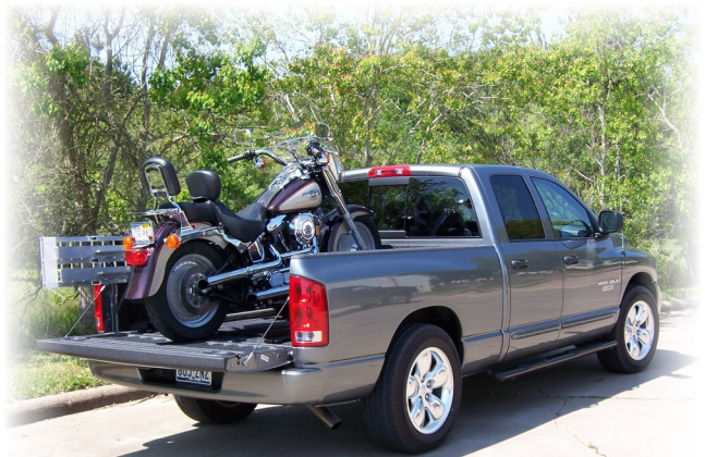
DODGE 1500 5'-5" BED