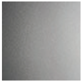
14 silver met