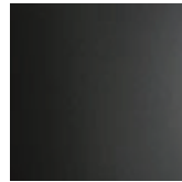
OP69 matt graphite