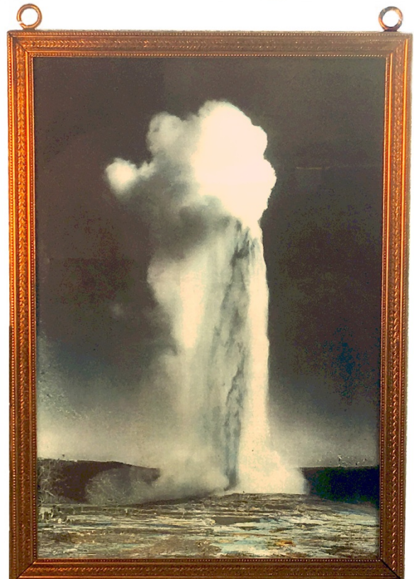
Figure 8: 1937-style 5"x7" Haynes hand-colored window transparency in gold-plated frame. Old Faithful Geyser.

For the next thirty years of operation, the Haynes' Studio transparency offerings changed little. The selection established in 1937 remained the proffered selection: three standard sizes, all in color, and all with metal frames. The one notable exception was the introduction in 1947 of a view of Norris Geyser Basin (Haynes # 15043) on glass measuring 10"x43". 28 No known surviving examples of this transparency are reported and likely do not exist due to the fragility of such a long, narrow piece of glass, even if backed by a