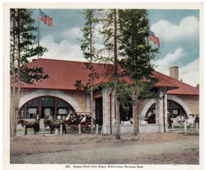
Figure 4: S.B. Smith image showing Haynes transparencies hanging in the O.S.L. Depot.