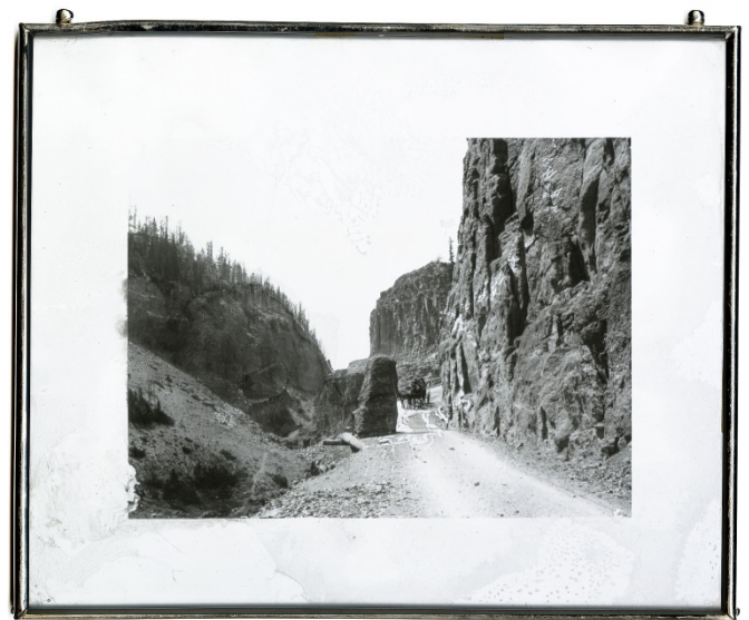
Figure 3: 1887 10’x12” Haynes transparency in metal frame. Golden Gate.

“ ... In a few days the windows of the Yellowstone depot will be decorated with twelve 2x4 colored transparent photographs of scenes in the park. The pictures are the work of F. J. Haynes, the official Yellowstone park (sic) photographer, and were presented to the passenger department of the Oregon Short Line. They were wonderful photographic work and the coloring is said to be as near perfect as art can make them. The transparencies show the gysers (sic) active and inactive, the punch bowl, a coaching party in the park, the crater Gatto (sic),