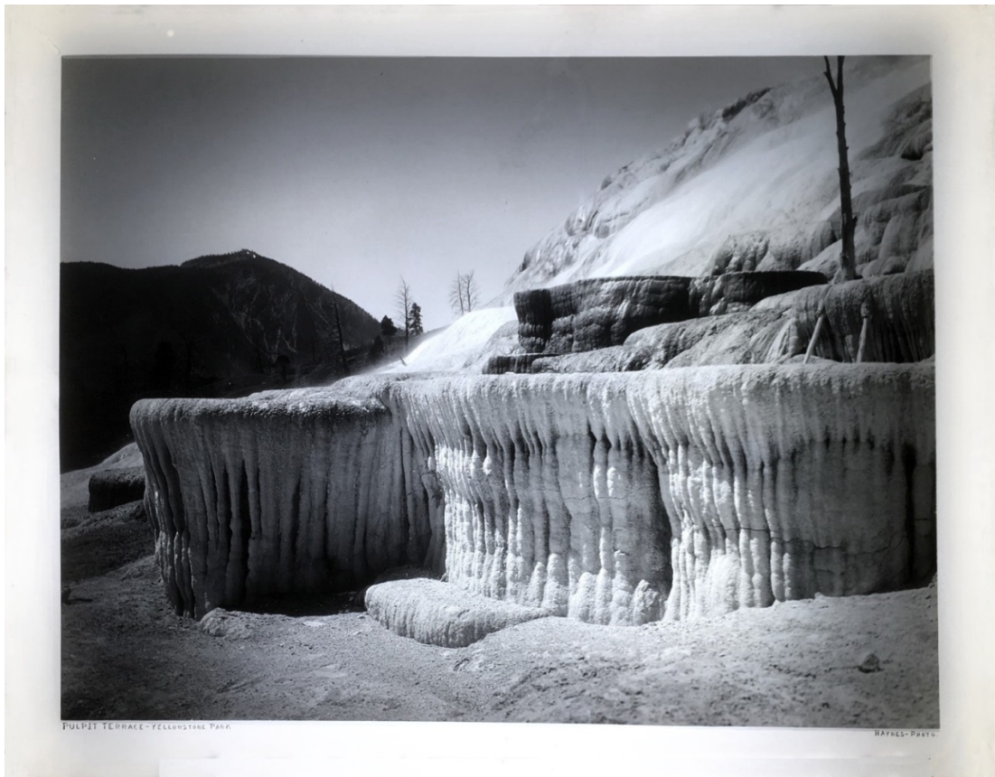
Figure 5: Circa 1913 19"x 24" Haynes b/w glass window transparency without frame. Pulpit Terrace.

The year 1913 brought more changes. For the first time, Haynes created for public sale a set of transparencies made from images he had captured in the past using his mammoth camera. These extra-large images, 16”x21”, were posited on a 19”x24” plate and backed with a frosted pane of the same size. It is not known if Haynes sold these pieces framed, but the only known extant piece (Pulpit Terraces) is without frame. In 1914, the price for the black and white version was $10 ($250 in today’s money) and $25 ($625 in today’s money) for the hand colored version. 23 After 1915, this product size was discontinued, most likely due to cost of product and breakage in shipping.