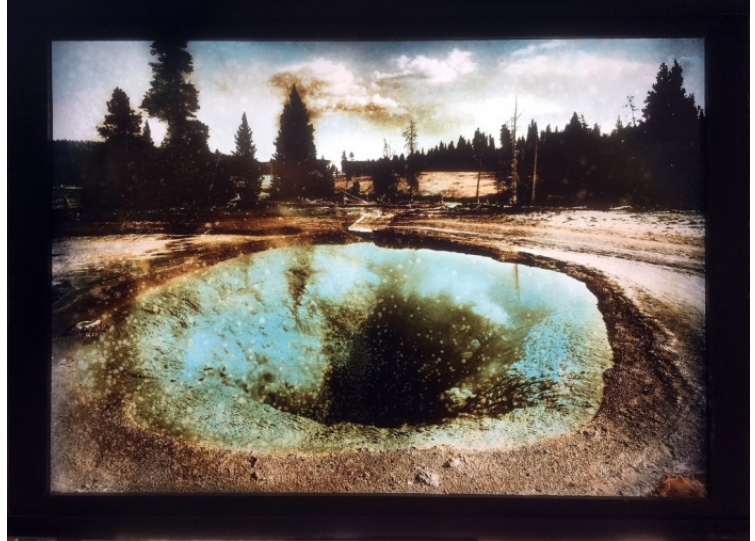
Figure 6: 1920-style 12"x17" Haynes hand-colored transparency in black wood frame. Morning Glory Pool.

Upon assuming control of his father's business in 1916, Jack Haynes continued the sale of transparencies, but under a different business model. His 1920 Catalogue shows an offering of only one size, 12"x17", and only five choices of views. Furthermore, the product came only in a hand colored version, framed in less expensive black wood. 24 By 1926, Jack Haynes had slightly improved the number of view choices to six, while adding the additional and smaller format of 7"x10". 25