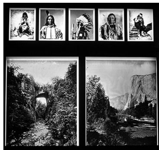
Figure 2: 1904 Hillers window transparencies (restored) in Riordan Mansion State Historical Park, Flagstaff, AZ.