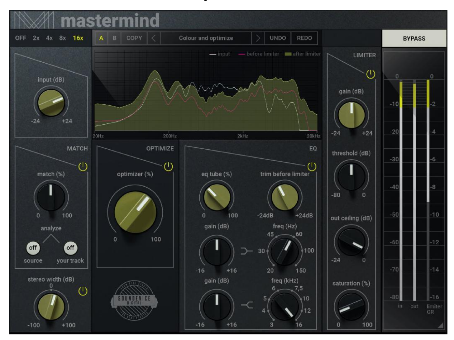
Input - Controls the gain of the input from -24 to +24 dB

MasterMind is a swift mastering tool which allows you to optimize your tracks in a second, match your tracks EQ with a reference track and boost the master gain.