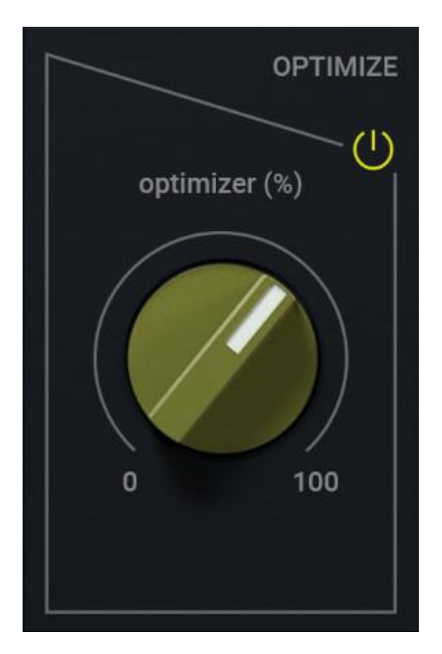
Optimizer - Controls the level of special intelligent optimization algorithm process, which instantly enhances your signal to sound bigger and better

Optimizer Power - Turns on/off the Optimizer section