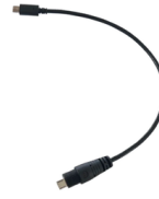
Cable Fits Internal Room Sensor