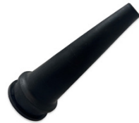
Humisonic Internal Funnel