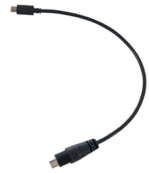
Cable Fits External Room Sensor