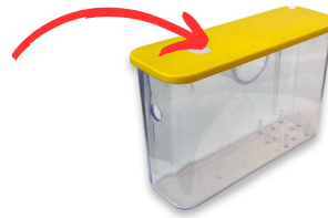
Lid (Fits Side Reservoir)