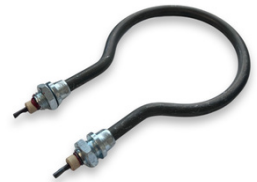
Internal Heating Coil