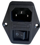
Switch & Fuse Box