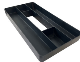
Internal Humidity Tray