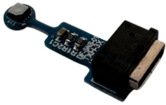
Internal Room Sensor (Filtered)