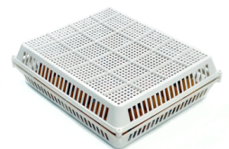
Hatching Egg Basket