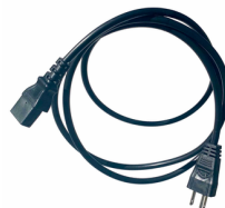
Electrical Power Cord