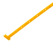
Main Turner Arm