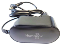
Adapter (Fits Humisonic Humidifier)