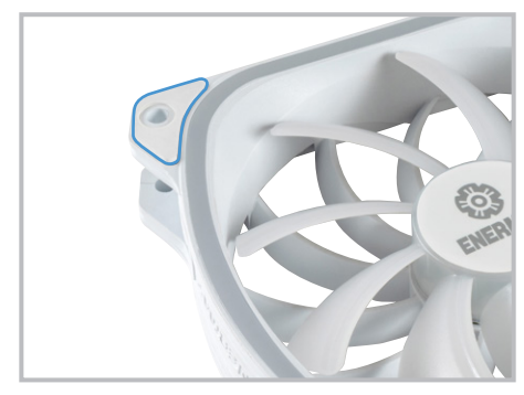
Vibration-damping Rubber Pads