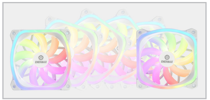
Case Moddings and Builds with Square-shaped Lighting Fan