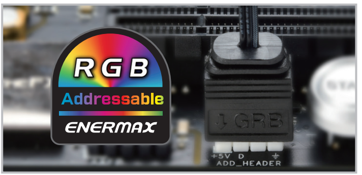
Addressable RGB Lighting Synchronization