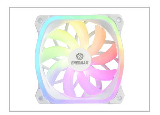
Unique Square-shaped Lighting