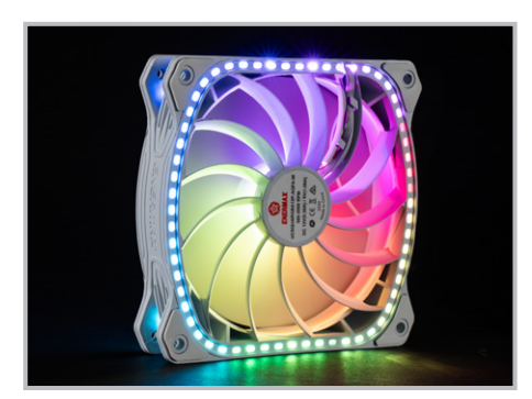
Diamond Bright Behind SquA RGB ADV