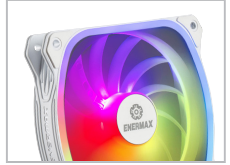
Festinated Hub RGB Lighting