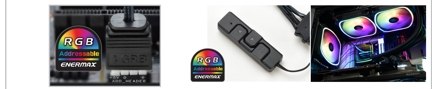
Motherboard Synchronization • Program preferred lighting effects via motherboard software

Luminous Aurabelt™ • 3D Layer Design that provides unique lighting effects with 16.8 million colors