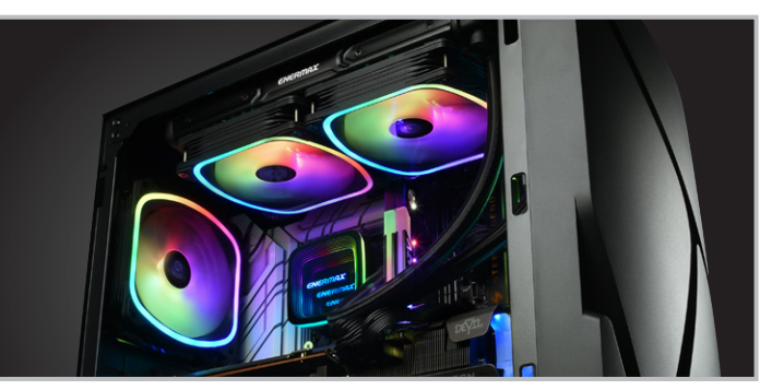
ENERMAX SquA ADV Fans • Provide optimal cooling performance

Luminous Aurabelt™ • 3D Layer Design that provides unique lighting effects with 16.8 million colors