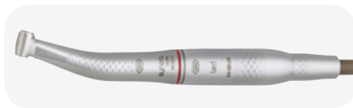
ISO Standard WK-93 LT + EM-E8 LED + VE-9