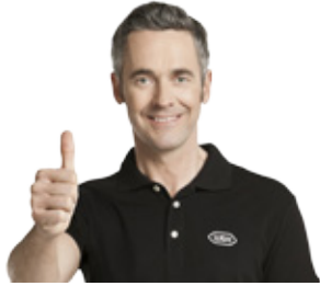
W&H Technical Service

»The better the care, the longer the pleasure.« Regular cleaning and care of your instruments protects them against premature wear and unnecessary service costs.