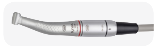
ISO Short WK-93 LTS + EM-12 L + VE-10