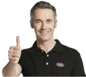
W&H Technical Service

Regular cleaning and care of your instruments protects them against premature wear and unnecessary service costs.