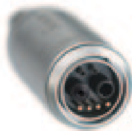
Connection of the motor to the supply silicone hose has been further simplified thanks to the use of a electrified 4-hole connection.