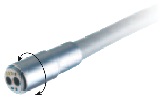
540°-swivelling connection through the special silicone hose