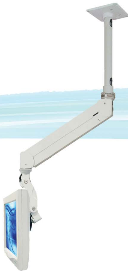
Elite with Quicklink Adjustable LCD Ceiling Mount