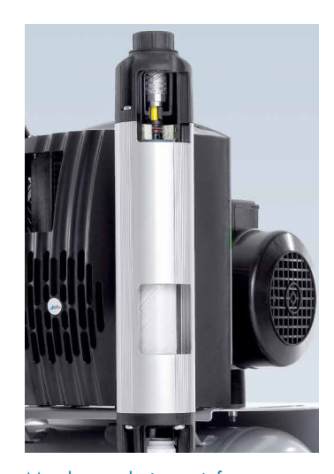
Membrane-drying unit for non-stop operation.

After compressors have been running for a longer time, moisture in the adsorption dryer increases. Yet the membrane-drying unit remains constantly dry and requires no regeneration interruption.