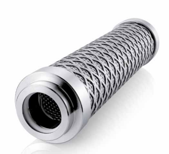
An optional sterile filter with a grade of filtration of 0.01 µm is available for even better air quality.*