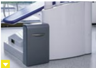
CS 1, CAS 1 and CA 1 can be used externally in the practical housing.

3 Separation rates measured by the TÜV [technical monitoring authority] Essen in accordance with the German standard test at maximum rate of fluid flow