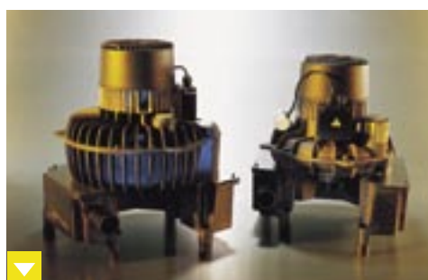
Dürr V suction machines - central vacuum generators of the "dry" Dürr suction systems