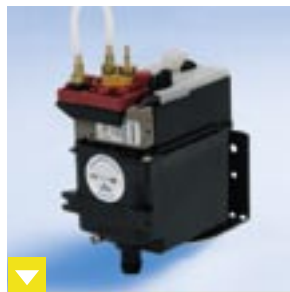
Rinsing unit for producing a fine film of water that protects the separation machine from deposits.