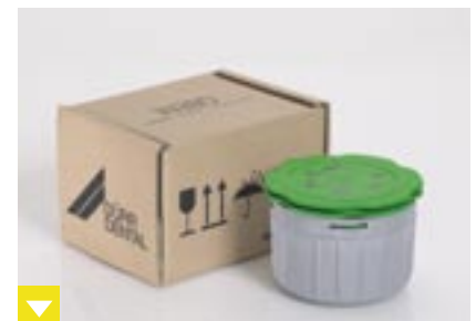
Dürr Dental recommends waste disposal companies that are able to accept filled amalgam collection vessels.