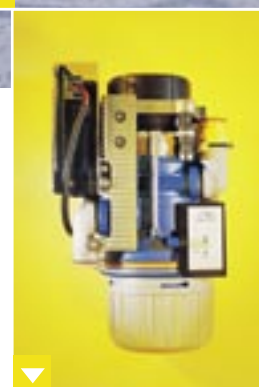
CAS 1 Combi-Separator – a separating system with integrated amalgam separator