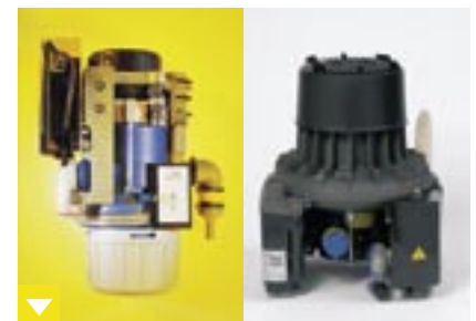
The CA 1 provides amalgam separation for the combination suction unit Dürr VS 300 (S).