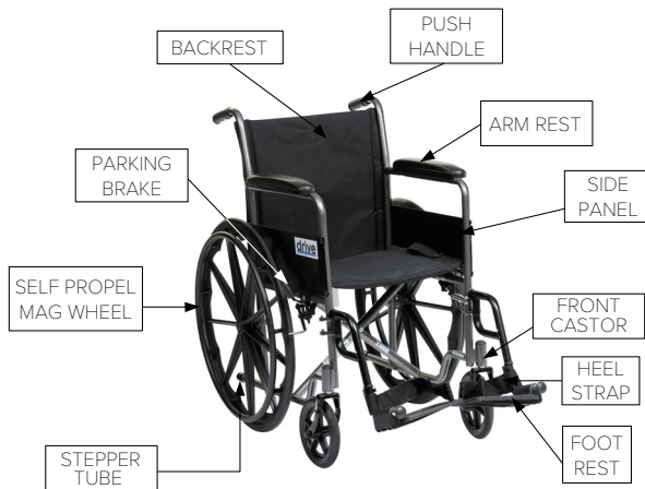
Silver Sport Wheelchair (SSP118FA-SF)