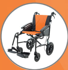
Transit version available