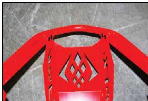
2. ASSEMBLE ARSPFX FRONT BUMPER TO SKID PLATE USING (2) SHORT RIVETS ON EACH SIDE.

*UNPLUG WIRE HARNESS BEFORE REMOVING HOOD AND UNPLUG PIPE SENSOR.