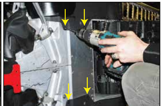
6. FLIP SLED ON SIDE, POSITION POLYETHYLENE SKID PLATE TO LOCATE AND DRILL OUT STOCK RIVETS LOCATIONS.