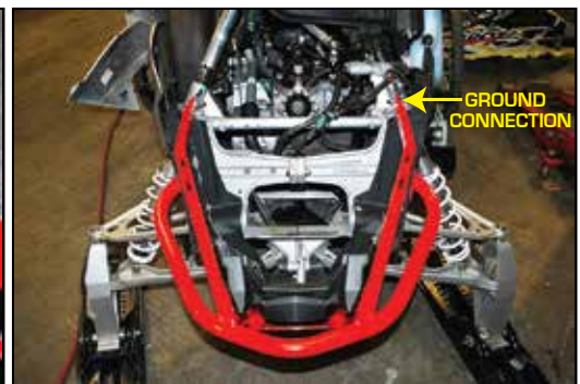
3. SLIDE BUMPER INTO PLACE AND USE FACTORY HARDWARE TO SECURE. *NOTE GROUND CONNECTION