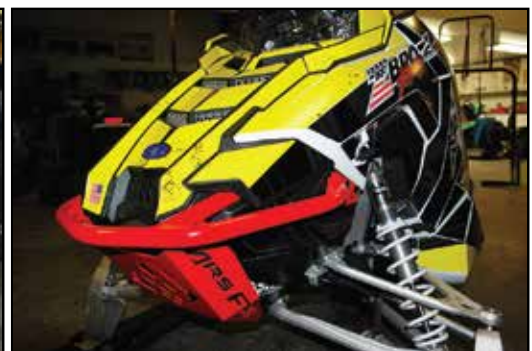
9. INSTALL PIPE AND PLUG IN SENSOR. ATTACH HOOD, PLUG IN WIRE HARNESS. THEN ATTACH SIDE PANELS.