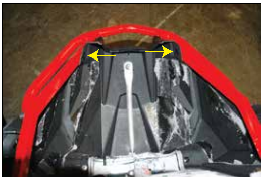
4. ATTACH TOP OF BUMPER USING (2) SHORT RIVETS, (1) ON EACH SIDE.