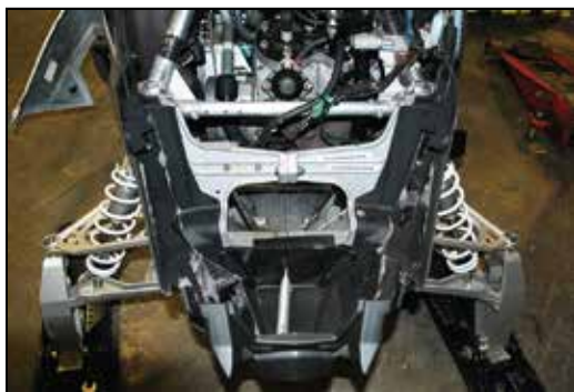
1. REMOVE SIDE PANELS, HOOD, PIPE AND STOCK BUMPER. USE 10MM END WRENCH AND SOCKET TO REMOVE STOCK BUMPER.

*UNPLUG WIRE HARNESS BEFORE REMOVING HOOD AND UNPLUG PIPE SENSOR.