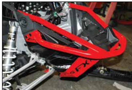
5. POSITION AND PRESS BUMPER ALONG SIDES OF BULK HEAD. DRILL HOLES THROUGH BULK HEAD FOR (2) SHORT RIVETS ON EACH SIDE.