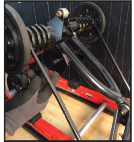
3. INSTALL NEW BILLET TORSION SPRING BLOCKS. REFER TO STEP 4 IF RUNNING OUR T-MOTION COIL OVER CONVERSION REAR SHOCK.