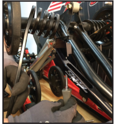
8. ADJUST BILLET TORSION SPRING BLOCK PRELOAD TO PREFERRED SETTING USING FLATHEAD SCREWDRIVER. ATTACH TORSION SPRING BACK INTO RAIL RETAINER.