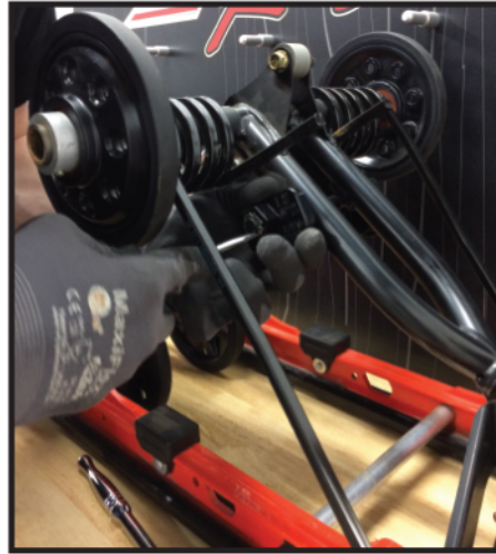
2. REMOVE C-CLIPS FROM TORSION SPRING PRELOAD BLOCKS.