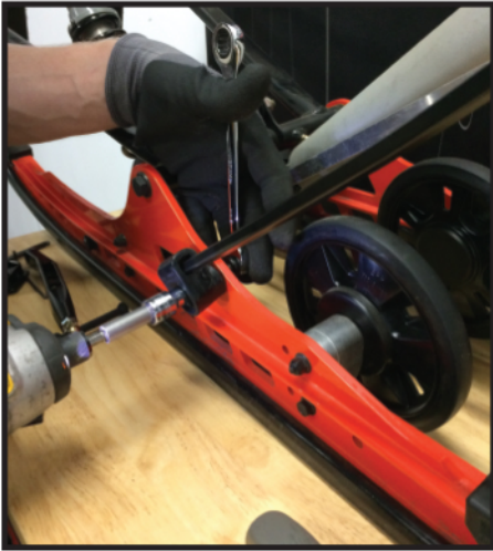
1. REMOVE TORSION SPRING FROM RAIL SPRING RETAINER.