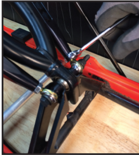
7. ADJUST HEIM JOINTS TO ALIGN BILLET LINK RODS TO REAR SCISSOR ARM BOLT HOLE ASSEMBLY AND TIGHTEN HEIM JOINT JAM NUTS. TIGHTEN REAR SCISSOR ARM BOLT.