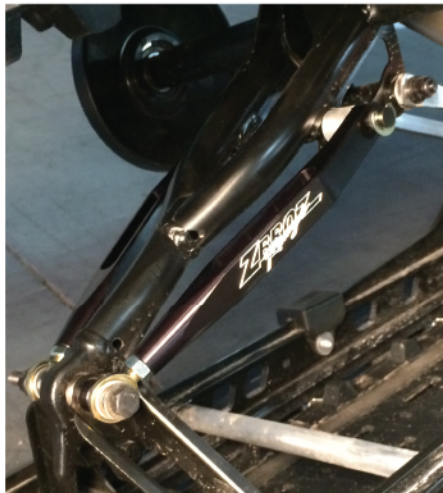
4. IF YOU ARE RUNNING OUR T-MOTION COIL OVER CONVERSION REAR SHOCK, YOU WILL USE SUPPLIED SPACERS INSTEAD OF BILLET TORSION SPRING BLOCKS.