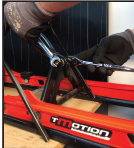
5. REMOVE REAR SCISSOR ARM BOLT. KEEP STOCK WASHER AND NUT TO BE REUSED IN STEP 5.