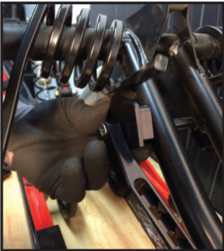
6. POSITION BILLET TORSION SPRING BLOCKS AND BILLET LINK RODS TO REAR SWING ARM ASSEMBLY AND ATTACH STOCK C-CLIPS.