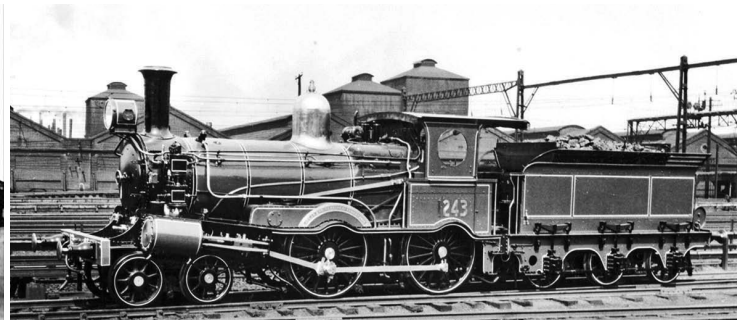
1243, “Centenary” lined green, Beyer, Peacock tender