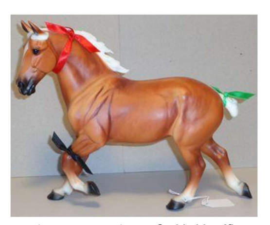
Reference image for the Stable Identifier. The ribbon or yarn may be placed anywhere on the model, but it should be consistent for all models in your show string. Also note the tag position.

Each horse needs a store-bought string tag attached to a leg. On the front of the tag, neatly write the horse's name, breed, gender and your entrant number (example: Y20 or C27). On the back of the tag, neatly write your full name. This is slightly different from how other shows do their tags, so please be aware!