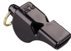
Fox 40 Mini