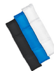
Skinny Double Sided Bean Bags

4 Part Plastic Signal Card • Larger fonts make it easier to read • Full color graphics and color coded penalty yardage indicators • Includes expanded signals 25 & 26 for horse collar tackle and illegal blindside block • NCAA and NFHS Penalty Yardage Included