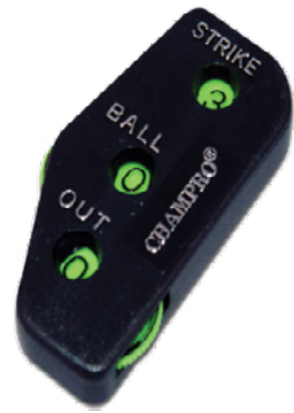
3-Way Plastic • Three function • Display: 3 strikes, 4 balls, 3 outs