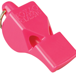
Fox 40 Classic Pink