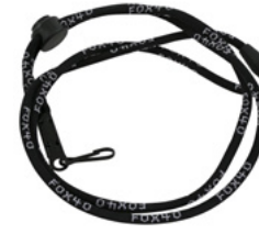
Black Push Button