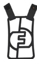
Force 3 Throat Guard