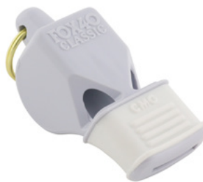
Fox 40 White CMG