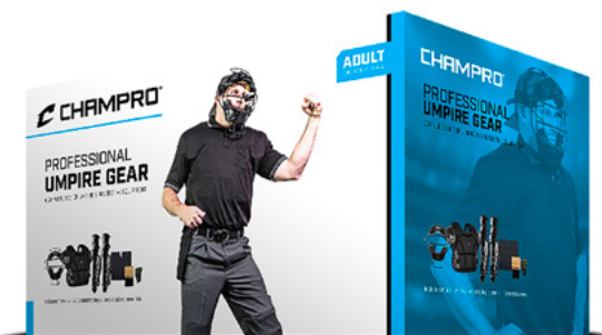
Champro Varsity Umpire Kit