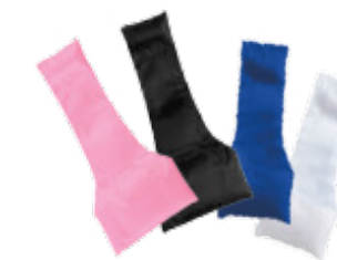
Long Neck Bean Bags