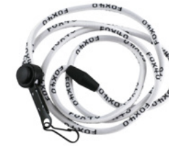
White Push Button