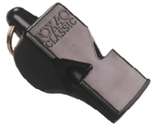
Fox 40 Classic