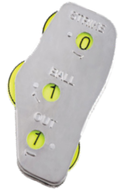
3-Way Metal • Three function • Display: 2 strikes, 3 balls, 2 outs