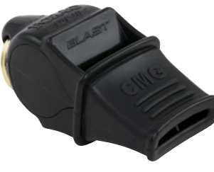
Fox 40 Sonic CMG