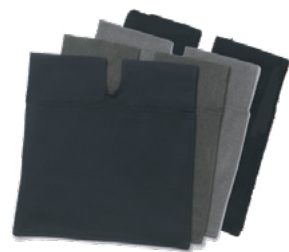
Smitty Ball Bags Navy, Charcoal, Heather, or Black