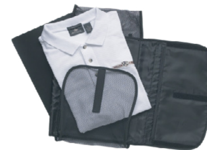
Texas Fold 'Em Travel Accessory