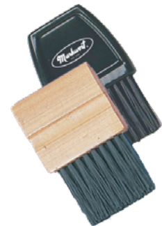
Plate Brushes Wood or Plastic