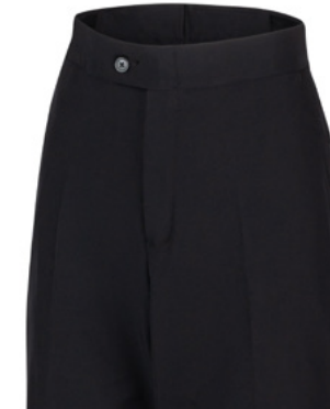
Women's Flat Front

The top pants worn in high school, college, and the pros • Available in men's or women's sizes • Choose flat front or pleated • Standard polyester or Advanced Technology 4-way Stretch • 4-way Stretch is a lighter more breathable material • Multiple fit-types available • Visit our website to see all styles and options