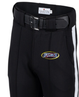
Available with Kentucky or Florida Logo