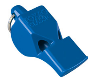
Fox 40 Classic Blue