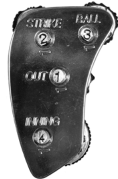
4-Way Die Cast Steel • Four function • Display: 2 strikes, 3 balls, 2 outs, 9 innings