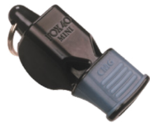
Fox 40 Mini CMG