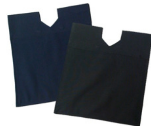
Dri-Low Ball Bags Navy or Black