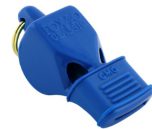
Fox 40 Blue CMG