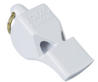
Fox 40 Classic White