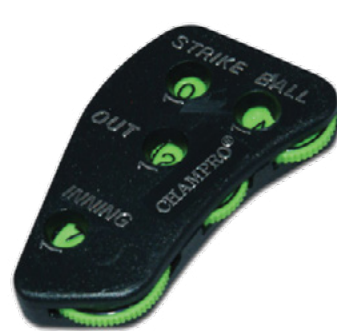
4-Way Plastic • Four function • Display: 3 strikes, 4 balls, 3 outs, 9 innings