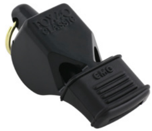
Fox 40 Classic CMG