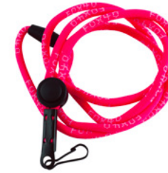
Pink Push Button