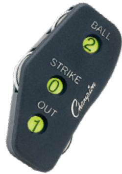
Large 3-Way Plastic • Three function large numbers • Display: 3 balls, 2 strikes, 2 outs