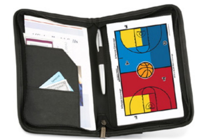
Pre-Game Board with Zippered Padfolio