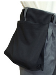
Smitty Deluxe Ball Bags Navy, Charcoal, Heather, or Black