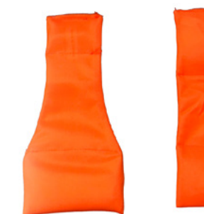
Orange Bean Bags