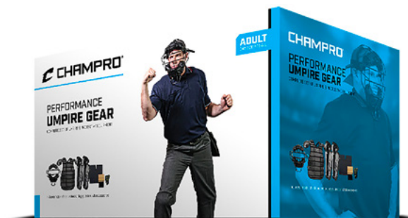
Champro Starter Umpire Kit