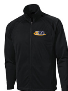
State Logos Available