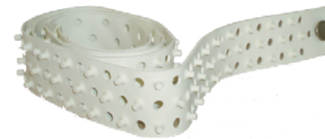
Hidden Tailor Flex Belt