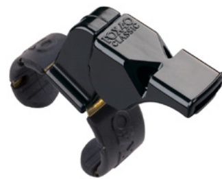
Fox 40 Classic Finger