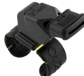
Fox 40 Finger CMG