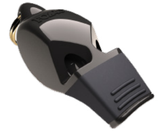
Fox 40 Eclipse