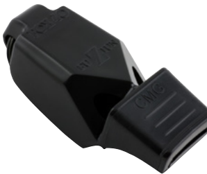
Fox 40 Fuziun CMG