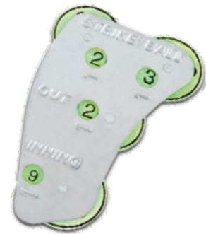
4-Way Metal • Four function • Display: 2 strikes, 3 balls, 2 outs, 9 innings