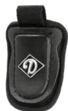
Diamond Throat Guard