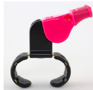
Fox 40 Finger CMG Pink