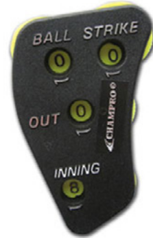
4-Way Plastic • Four function • Display: 4 balls, 3 strikes, 3 outs, 10 innings