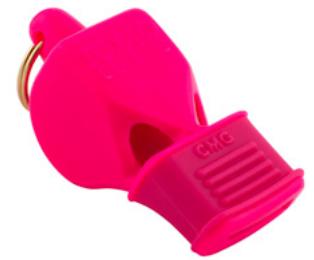
Fox 40 Pink CMG