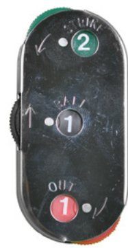
3-Way Metal Oval • Three function • Display: 2 strikes, 3 balls, 2 outs