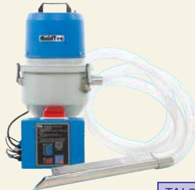
Wand and loader hose included