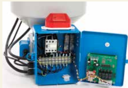
High Quality electrical and electronic controls