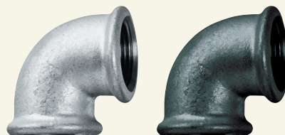
Female 90° Equal Bend