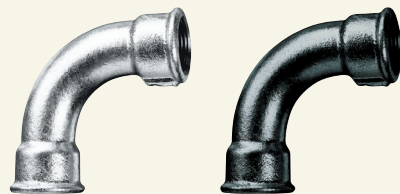
Female 90° Equal Bend