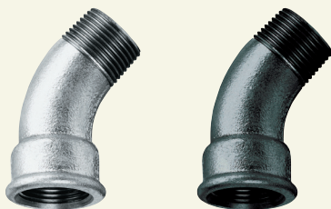
Male X Female 45° Equal Bend