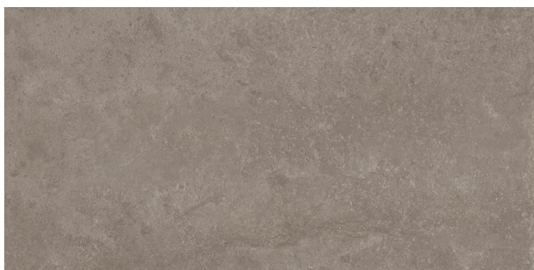
PSG013 - Passage Rock