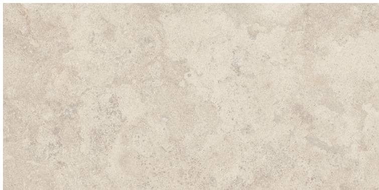
PSG010 - Passage Ice