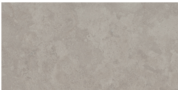
PSG011 - Passage Wind