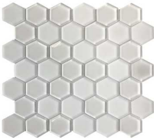
Omni White (OM10)