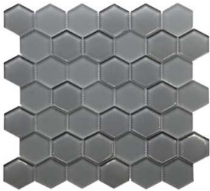
Omni Grey (OM11)