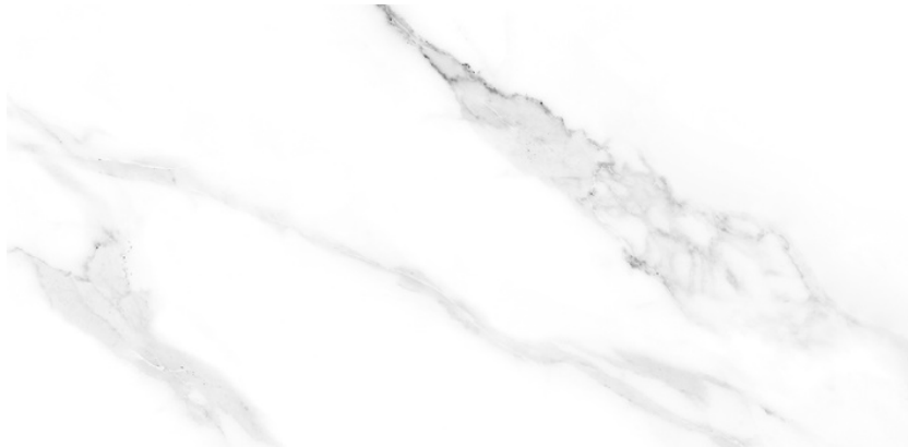
PSToro - White Calacatta