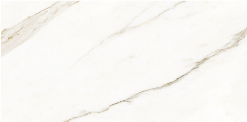
ELGoro - Gold Calacatta

12x24 | 24x24 Polished & Matte Porcelain