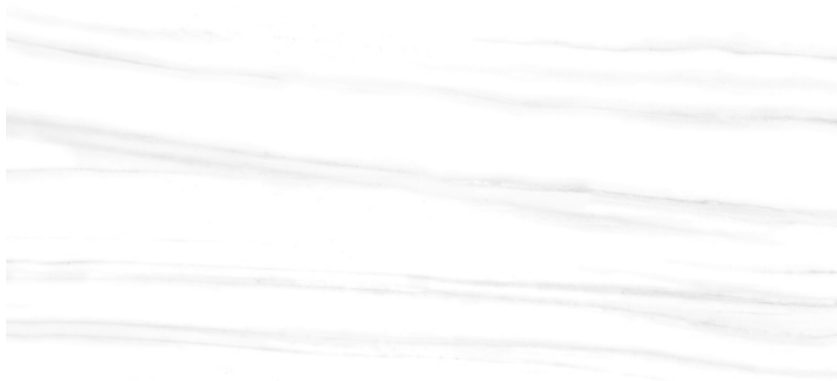
SPDoro - Bianco Dolomite