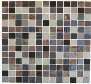
Cosmos Firenze Malla (CS130)

Type Mosaic Material Recycled Glass Size (Nominal) 13 1/4"x13 1/4" Chip Size (Nominal) 1"x1" Thickness 1/16" Country of Origin Spain Finish Matte & Glossy Shade Variation V2