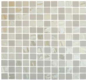
Cosmos Blanco (CS100)