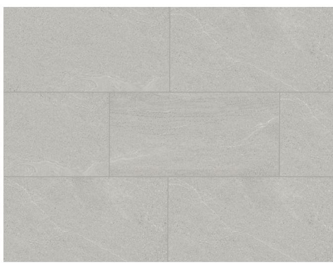
BST03PV - Boston Gray