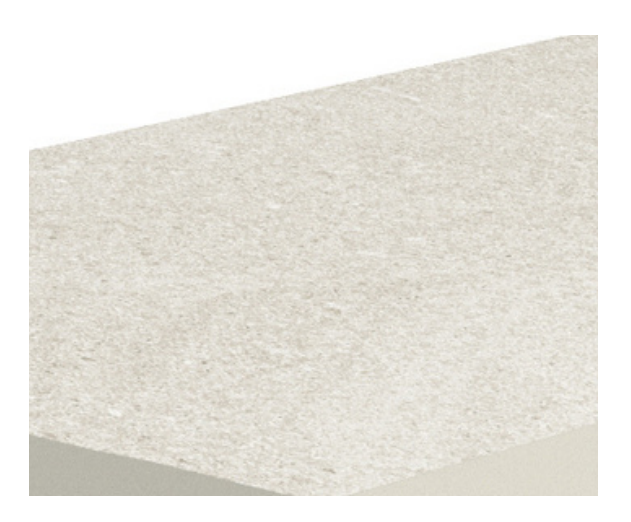
BST01PV - Boston White