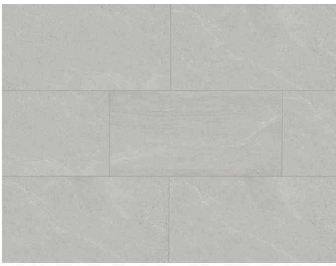
BST03 - Boston Gray